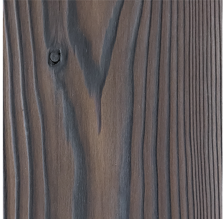
[ MUD ] MUD

FASTENING (EXTERIOR): RIM-SHANK FACE NAILS OR SCREWS WITHIN 1 " OF EDGE SUBSTRATE (EXTERIOR): FURRING MAXIMUM OF 16" ON - CENTER FASTENING (INTERIOR): ADHESIVE GLUE W/ PIN OR TRIM NAILS SUBSTRATE (INTERIOR): REFER TO ARCHITECTURAL DRAWING SPECIFICATIONS