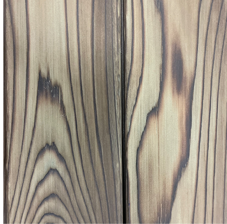
[ LG ] LIZ GREEN

FASTENING (EXTERIOR): RIM-SHANK FACE NAILS OR SCREWS WITHIN 1 " OF EDGE SUBSTRATE (EXTERIOR): FURRING MAXIMUM OF 16" ON - CENTER FASTENING (INTERIOR): ADHESIVE GLUE W/ PIN OR TRIM NAILS SUBSTRATE (INTERIOR): REFER TO ARCHITECTURAL DRAWING SPECIFICATIONS