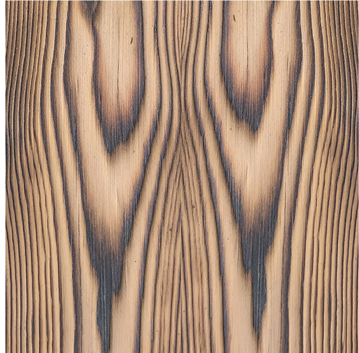
[ WÎT ] WHITE

FASTENING (EXTERIOR): RIM-SHANK FACE NAILS OR SCREWS WITHIN 1" OF EDGE SUBSTRATE (EXTERIOR): FURRING MAXIMUM OF 16" ON - CENTER FASTENING (INTERIOR): ADHESIVE GLUE W/ PIN OR TRIM NAILS SUBSTRATE (INTERIOR): REFER TO ARCHITECTURAL DRAWING SPECIFICATIONS