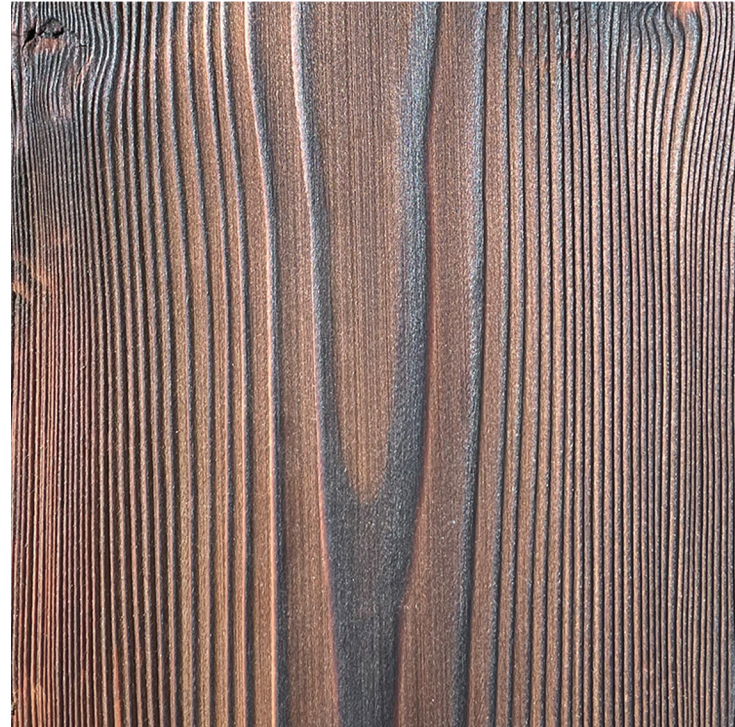
[ BRØN ] BROWN

FASTENING (EXTERIOR): RIM-SHANK FACE NAILS OR SCREWS WITHIN 1 " OF EDGE SUBSTRATE (EXTERIOR): FURRING MAXIMUM OF 16" ON - CENTER FASTENING (INTERIOR): ADHESIVE GLUE W/ PIN OR TRIM NAILS SUBSTRATE (INTERIOR): REFER TO ARCHITECTURAL DRAWING SPECIFICATIONS